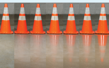
Shiny, Restored Flooring